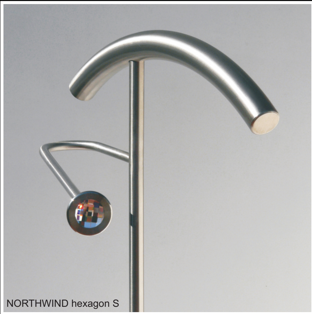
NORTHWIND hexagon S