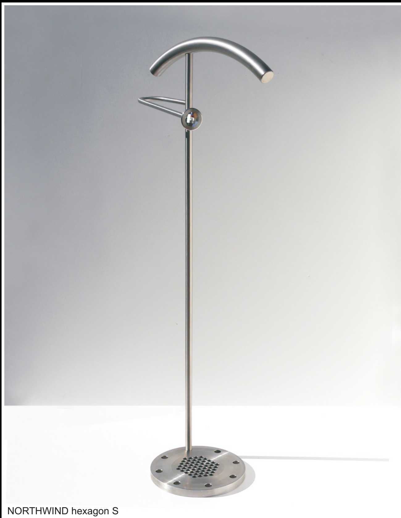
NORTHWIND hexagon S