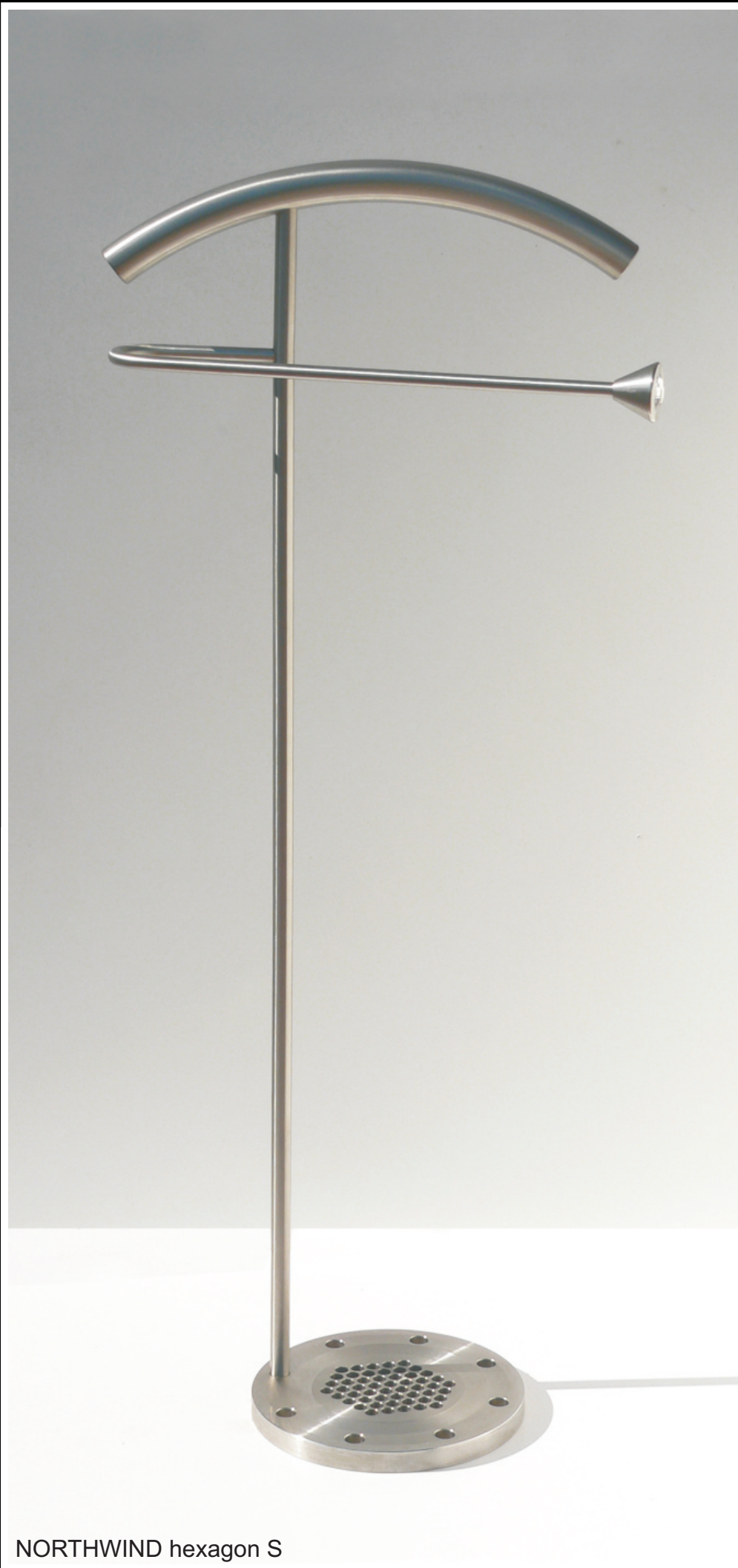
NORTHWIND hexagon S

Servo muto e portasciugamano. Valet stand and towel stand.