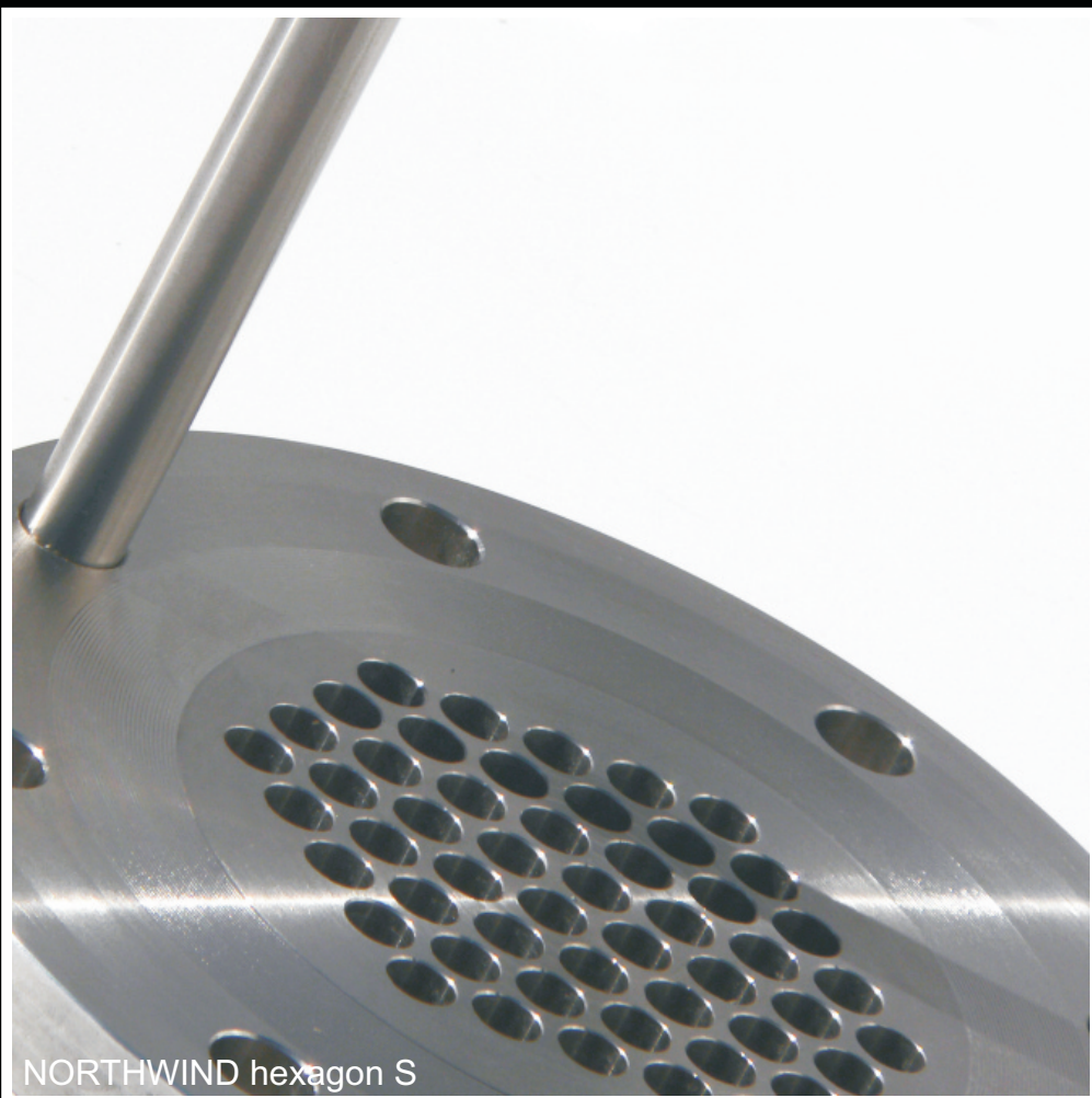
NORTHWIND hexagon S